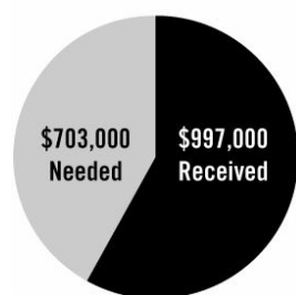
Northgate Little Theatre